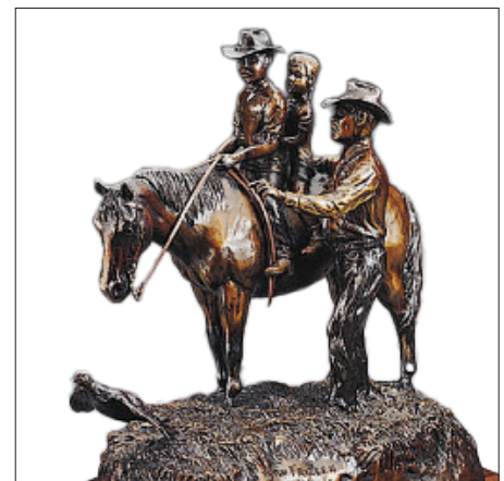
“Caretakers of the Land” bronze gifted to National winner.